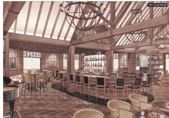
The Club Room