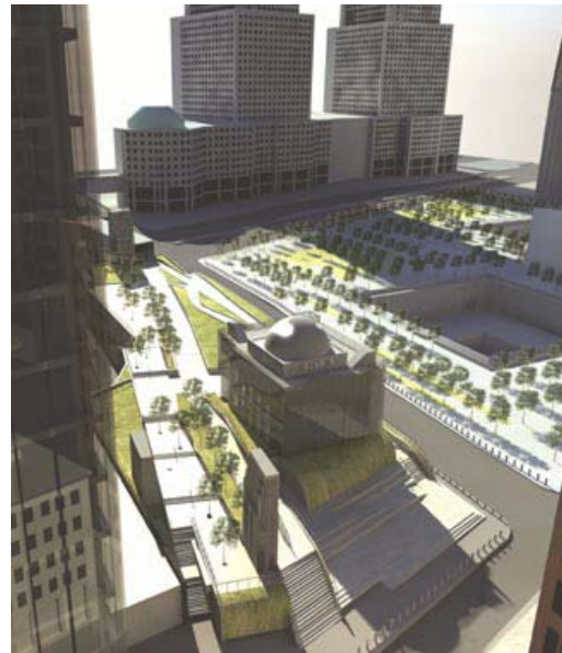
St. Nicholas Church in the Park - Model