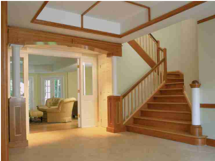
Interior View Main Hall

A Connecticut residence that incorporates regional charm with contemporary planning concepts. This shingle style home was designed to achieve balance between the formal and family needs of the client's program.