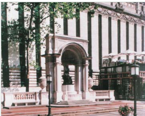
William Cullen Bryant Memorial

The success of the restoration of Bryant Park has become a model of urban rebirth and revitalization nationwide. Our office was part of the design team responsible for this achievement.