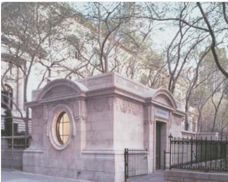
Restoration of Park Structure